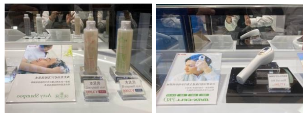
Reve21 shampoo and home care products

[Company Profile] Company name: Hair Clinic Reve21 Co., Ltd.