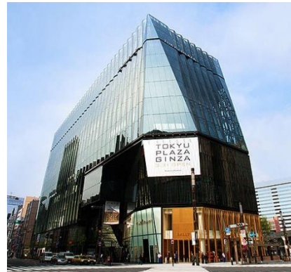
Lotte Duty Free Shop at Tokyu Plaza