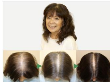
72 year old female