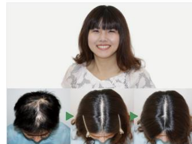
30 year old female